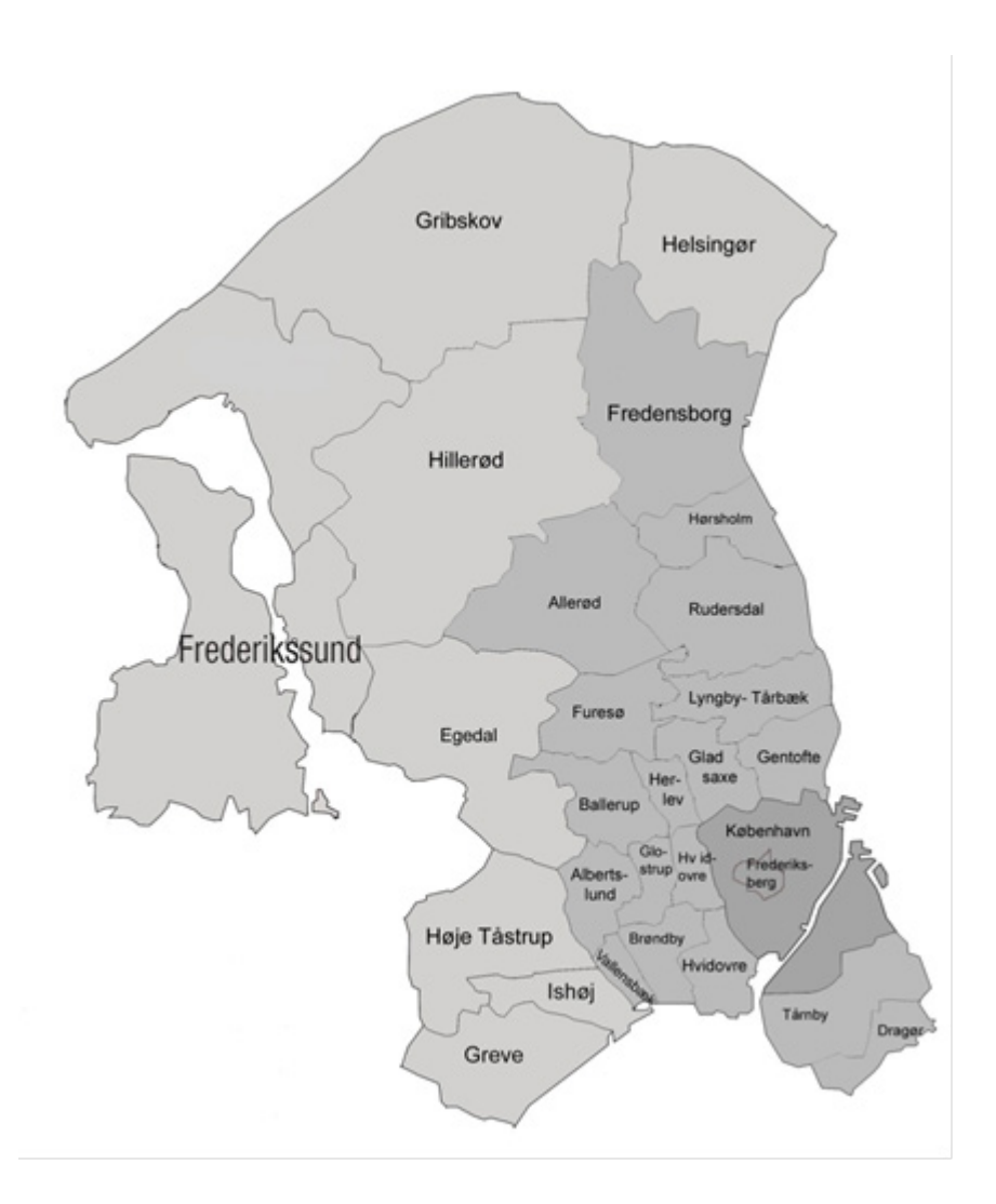
Annex 10 Division into zones